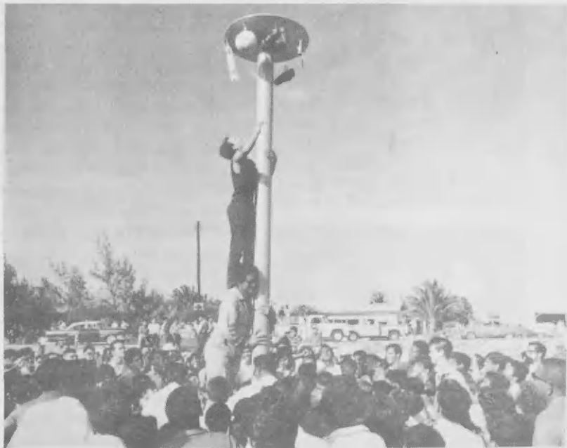
Climbing greased pole - Subi palu ceba.